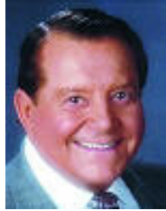
Founder Campus Crusade for Christ